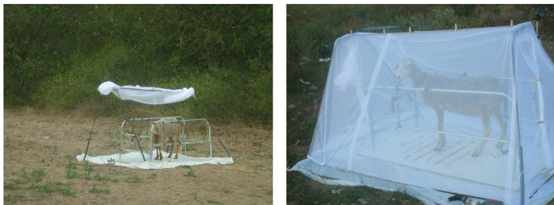
Fig. 2. Enclosure trap to capture host-seeking insects. The trap is open for an exposure period and then closed to allow feeding insects time to complete engorgement, after which insects are collected from the interior wall of the enclosure netting. (Online figure in color.)

also may be used to capture males; a particularly useful feature to identify members of a species complex where females are difficult to separate by morphology.